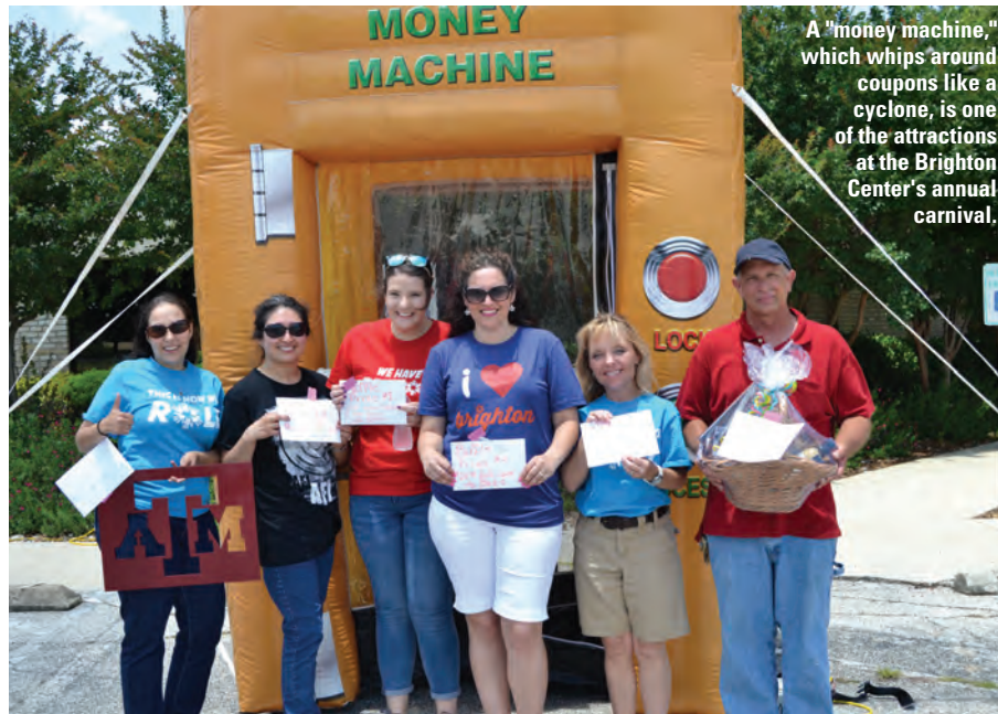
A "money machine," which whips around coupons like a cyclone, is one of the attractions at the Brighton Center's annual carnival.

The result is becoming this year's second-ranked organization in The NPT Best Nonprofits to Work survey and top medium-sized nonprofit. Much in the same fashion as OSU Foundation's culture change, many organizations on the list