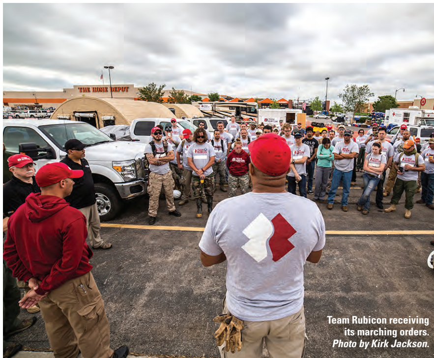
Team Rubicon receiving its marching orders.